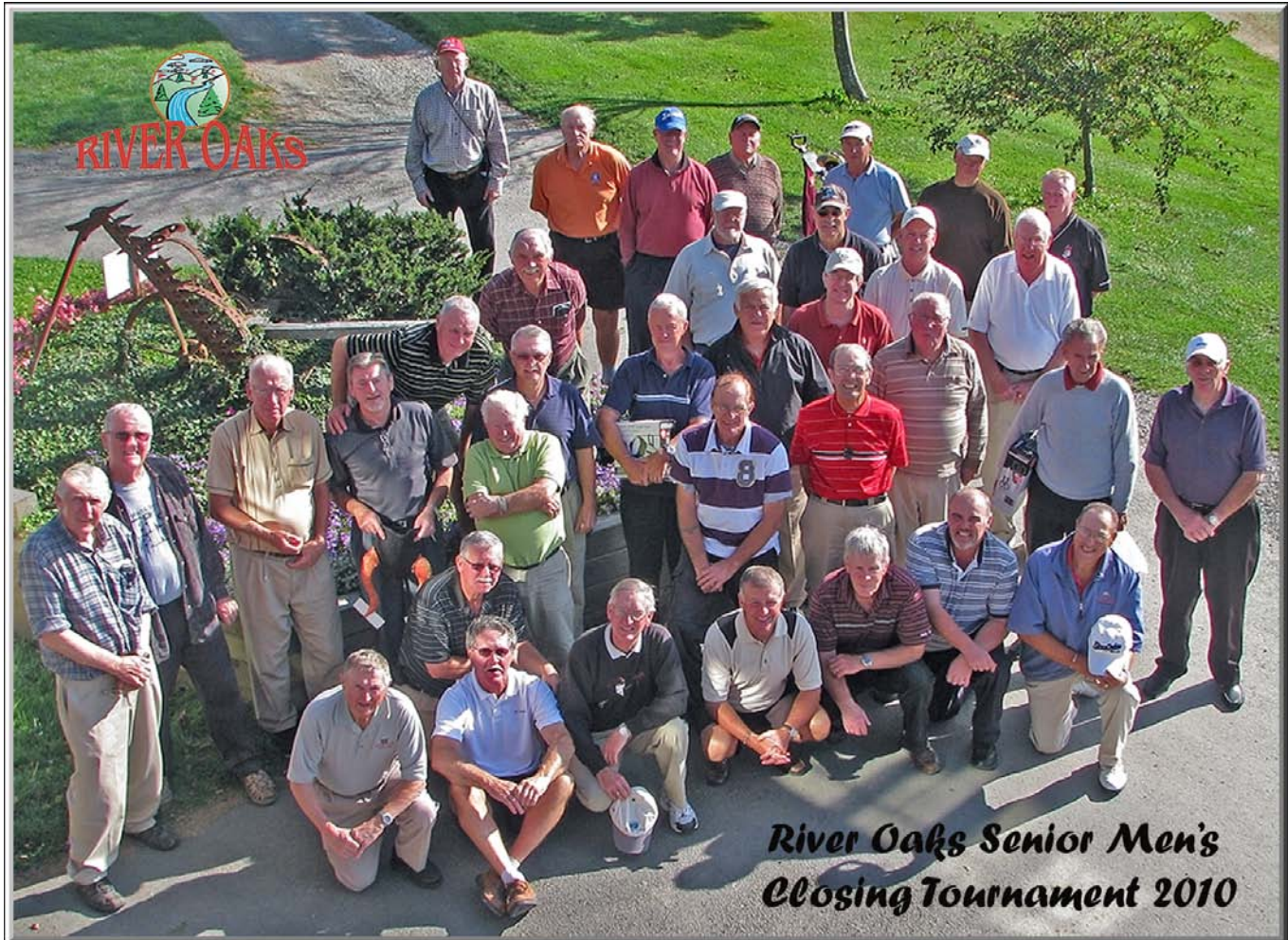
River Oaks Senior Men's Closing Tournament 2010